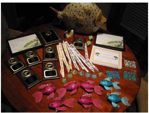
Adults get fish medallion plaques or TUFF Certificates; Children get really nice (heavy) gold or silver fish medallions plus gift bags with fish ornaments and fish stickers. A new BASS trophy plaque was introduced last year which is showcased on page one.