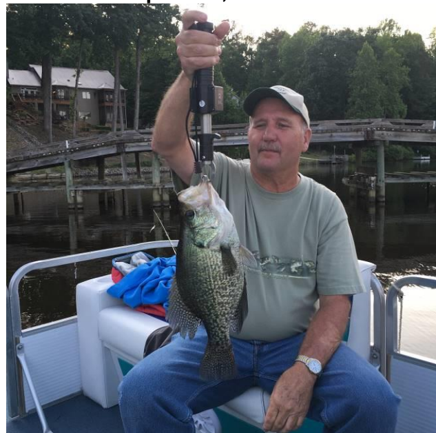
Just ten ounces shy of a North Carolina State record, this 17 inch crappie was caught May 15 at 6:30 PM on a jig near the 18 Creek golf cart bridge.